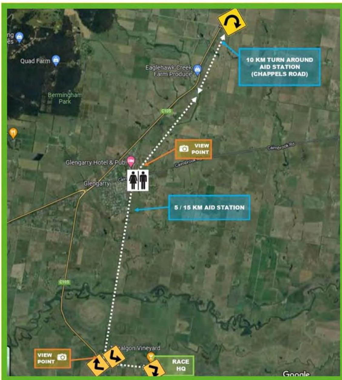
21.1 KM HALF MARATHON COURSE MAP