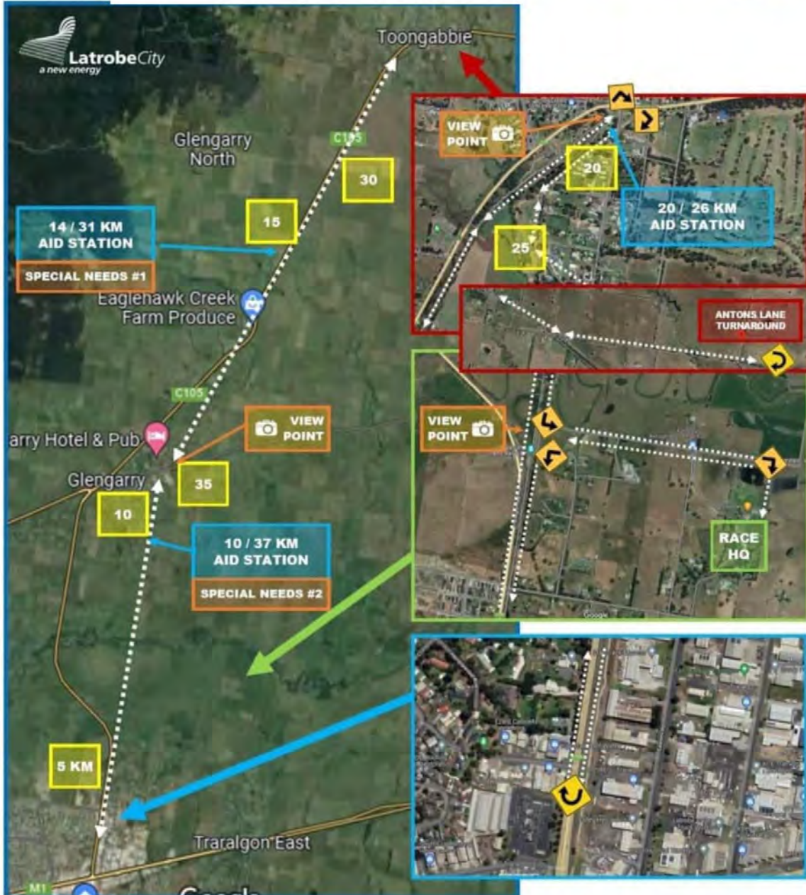
42.2 KM MARATHON COURSE MAP